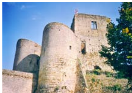
Church and castle of Semur en Brionnais